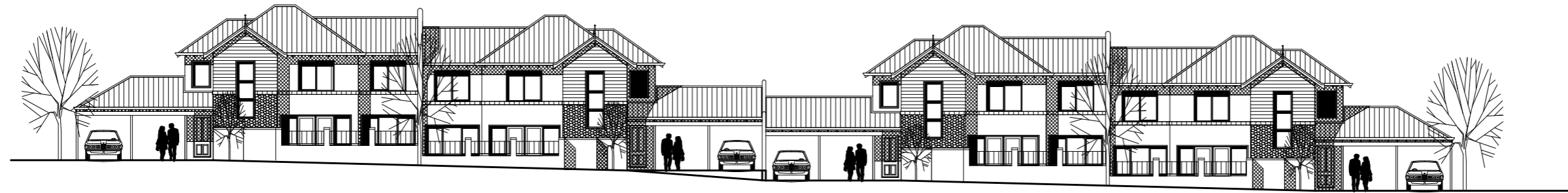
NED HIGGINS LANE ELEVATION